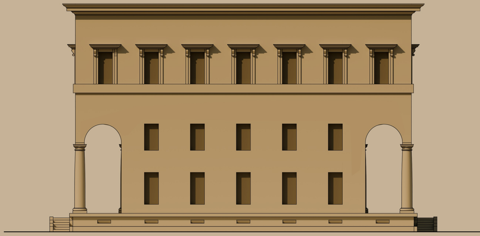
Prospetto laterale Scala 1: 100