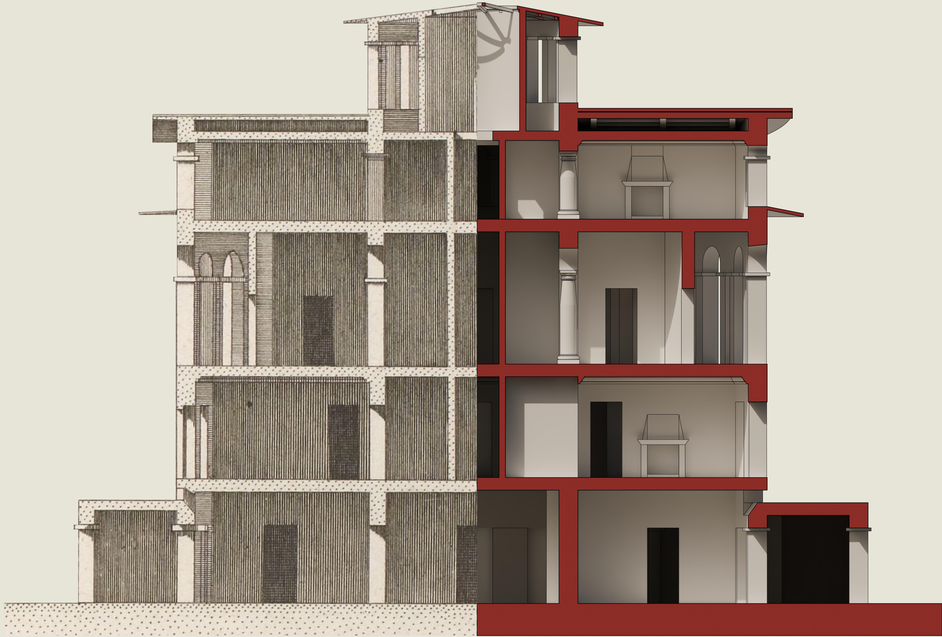
Disegno originale sezione trasversale, scala 1:60